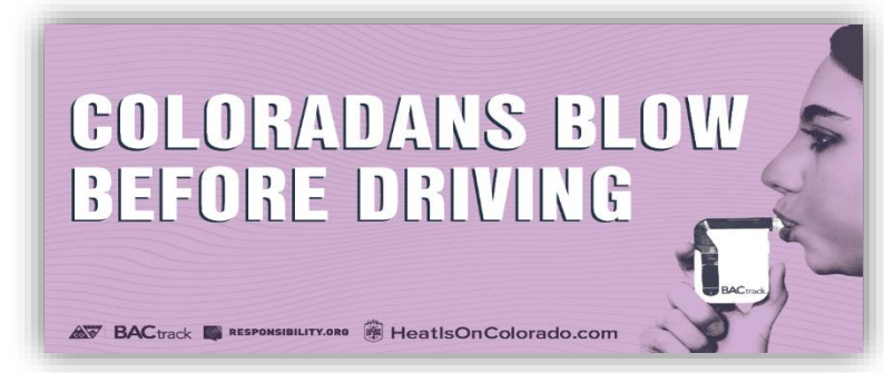
An eye-catching creative campaign, using location-specific messages, encouraged all Coloradans to use a breathalyzer anytime and anywhere alcohol is consumed.

As part of the 2018 The Heat Is On campaign, CDOT launched a program to incentivize the purchase of breathalyzers in Colorado and ultimately help reduce impaired driving and DUIs. Through a first-of-its-kind partnership with BACtrack, the leading personal breathalyzer company, breathalyzers were offered at an unprecedented 50 percent discount for Colorado residents.