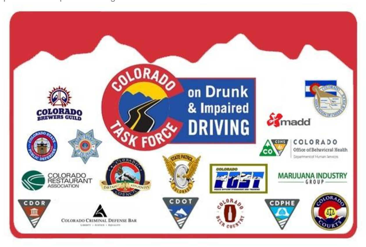
Visit our website at:

The vision of the Colorado Task Force on Drunk and Impaired Driving is a Colorado in which key stakeholders work in partnership to achieve a fully integrated solution to the problem of impaired driving.